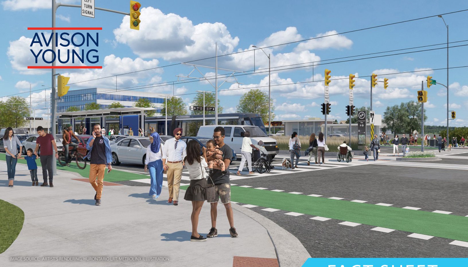
IMAGE SOURCE: ARTIST'S RENDERING, HURONTARIO LRT. METROLINX ILLUSTRATION