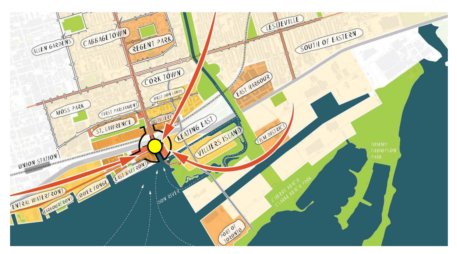
The dynamic area surrounding Sidewalk Labs' waterfront site.