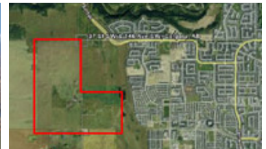
Residential Subdivision Calgary, AB, 480 acres - 4,500 housing units proposed