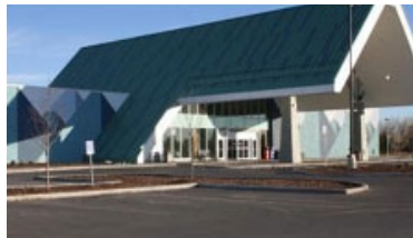
Casino , Grey Eagle Casino Tsuu T'ina Nation Reserve, AB, 85,000 sf gaming facility