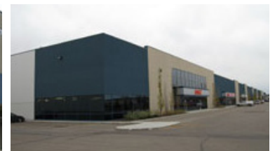
Westpoint Corporate Centre Edmonton, AB, Industrial complex 740,000 sf