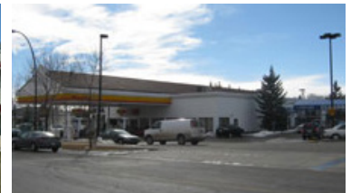
Gas Bar Shell Canada Avenida Facility Calgary, AB, 13,800 sf