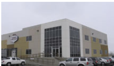
Canada Cartage Terminal Calgary, AB, Cross dock trucking 30,000 sf on 13.5 acres