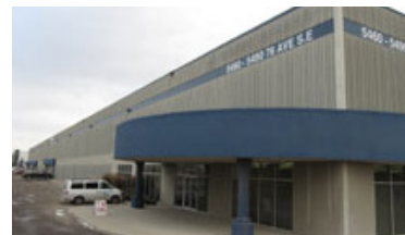
Great Plains Calgary, AB, Multi tenant industrial building, 160,000 sf