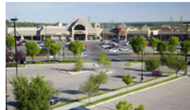
Cascade Plaza Banff, AB, Enclosed mall & office complex, 110,000 sf