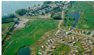
Recreational Resort Gleniffer Lake Resort & Country Club, Gleniffer, AB, 185 acres