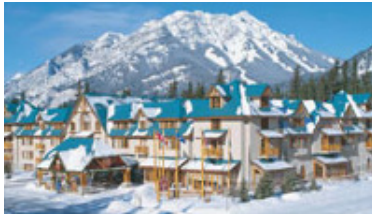
Hotel , Banff Caribou Lodge Banff National Park, Banff, AB, Full service hotel - 184 rooms