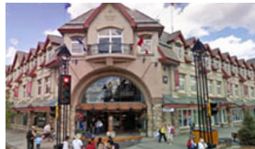
Sovereign Centre Calgary, AB, Class A Suburban 7 stories, 100,000 sf