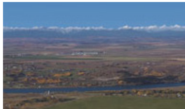
Estate Community Watermark, Calgary, AB 288 acre subdivision - 560 lots