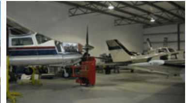
Airport Hangar Cavalier Aviation Building Springbank Airport, AB