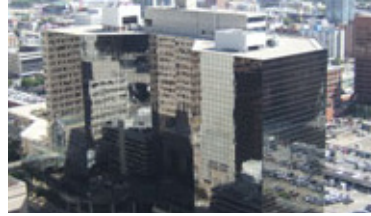
Gulf Canada Sq Calgary, AB, Class A Office, 20 stories, 1.07 million sf