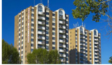
Glenmore Gardens Calgary, AB, Rental complex, 17 story towers