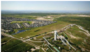
Residential Subdivision Cougar Ridge, Calgary, AB, 36 acre subdivision - 224 lots