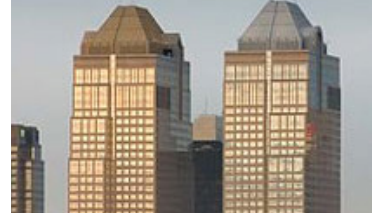
Bankers Hall Calgary, AB, Class AA Twin Office Towers, 47 stories, 1.85 million sf