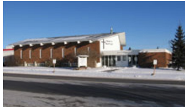
Church Trinity Baptist Church Calgary, AB