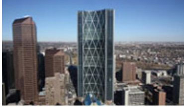
The Bow Calgary, AB, Class AA Office 59 stories, 2.05 million sf