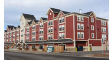
Cedar Station Airdrie, AB, Assisted living seniors complex, 87 units