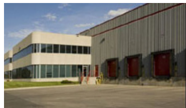
Foothills Calgary, AB, warehouse & distribution centre, 1,660,000 sf