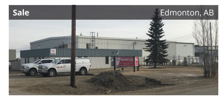
404 - 22 Avenue 18,505 sf on 2.87 acres Asking: $2,500,000 Cranes, Upgraded Office, Ample Yard